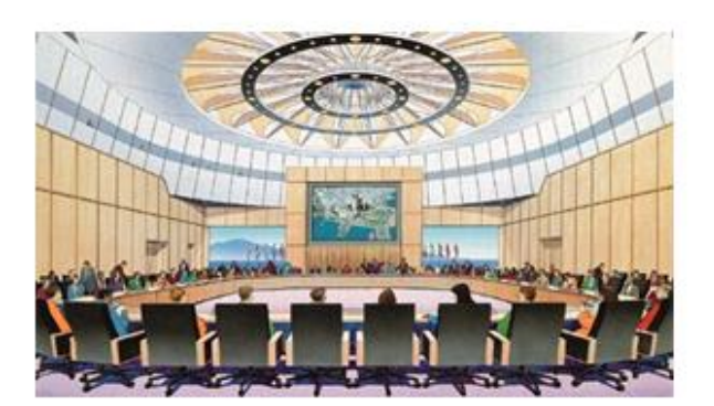
International Convention Hall for Oral Presentation is located at 6th floor of the Sun Port Takamatsu Symbol Tower.